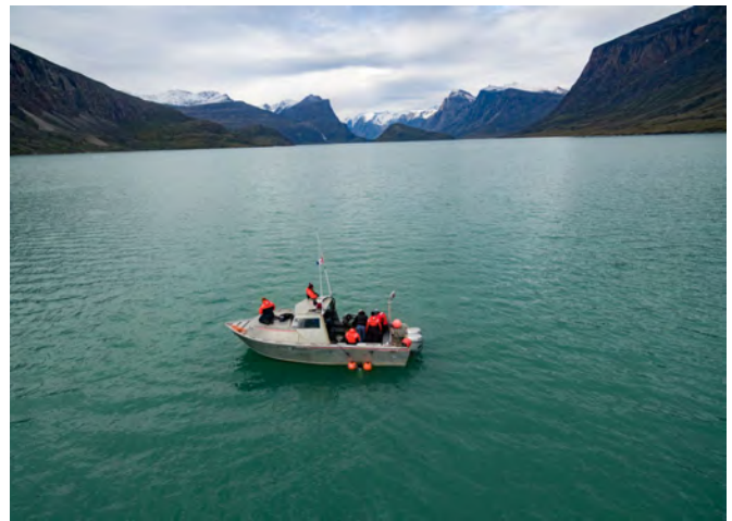
Figure 2. Vessel in Pangnirtung Fiord—image taken by UAV operated by Thomas Seitz from VDOS Global LLC (project collaborator).