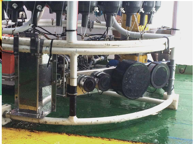
Acoustic transducers (l. to r.) 200, 125, 70 and 38 kHz.