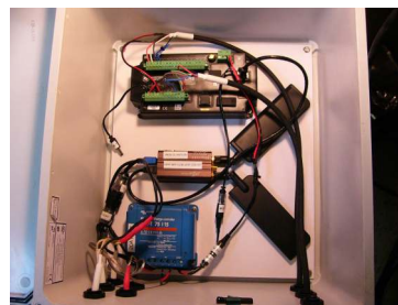
IP67 cabinet version