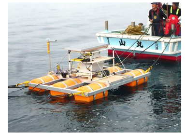
Raft example - see press release