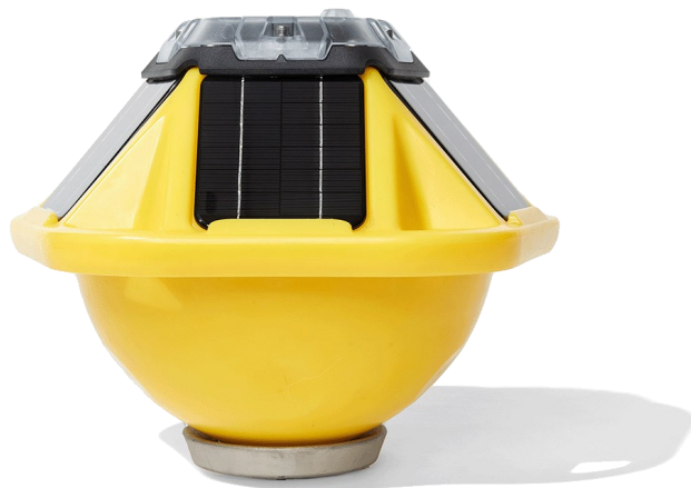
Figure 1. The Sofar Spotter is a compact, solar powered, rugged surface buoy with real-time capabilities that can transmit data from anywhere in the world.

The Sofar Spotter buoy has an optional Smart Mooring (Figure 2) that expands the platform to acquire up to three underwater sensors to collect data such as pressure for water levels and tides as well as water temperature. These data are passed to the Sofar Spotter buoy where they become accessible via the Sofar dashboard providing both real-time surface and subsurface data.