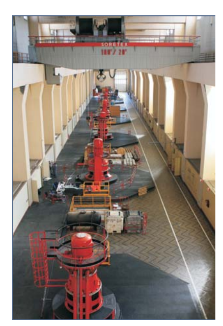
Powerhouse of the Châteauneuf du Rhône-Montélimar- Henri Poincaré hydroelectric plant

CNR is now going ahead with the purchase of a 30-path ASFM system for conducting measurements of Kaplan units and eventually measurements of bulb turbines at 12 of their plants along the Rhône River.