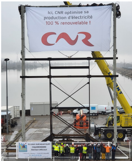
Figure 1. ASFM frame at the Beaucaire Hydropower Plant, Rhône River, France.

ASL AQFlow is pleased to announce that our Acoustic Scintillation Flow Meter (ASFM) is being used by the Compagnie Nationale du Rhône (CNR) to conduct flow measurements at the Beaucaire Hydropower Plant on the Rhône River in France as part of an electrical production optimization program. This site generates approximately 210 MW of hydroelectricity from six bulb turbines. Figure 1 shows the instrumented frame that is lowered into the hydroelectric plant intake to the turbine and is equipped with an ASFM array that measures flow across 30 paths. Prior to this installation, the ASFM was successfully deployed at the Châteauneuf-du-Rhône, Montélimar-Henri-Poincaré- hydroelectric plant, another of CNR's facilities on the Rhône River. The quality of the data collected at this site was considered very high and results were repeatable with an average uncertainty of roughly 0.4%.